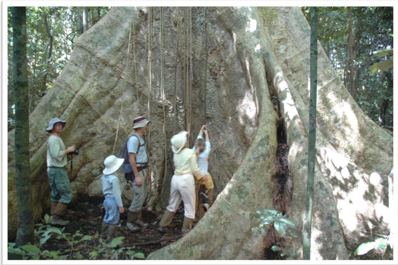
Big tree on Crocodile trail

Day 3. The morning jeep to Heaven rapid to find Pale-headed and Black-and-buff Woodpeckers, Black-and-red, Banded, Dusky Broadbill.