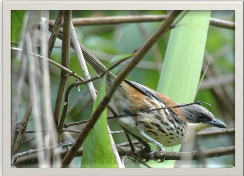
Grey-crowned Crocias

Two full days exploring Da Lat plateau, first of our visits is Ta Nung, a small