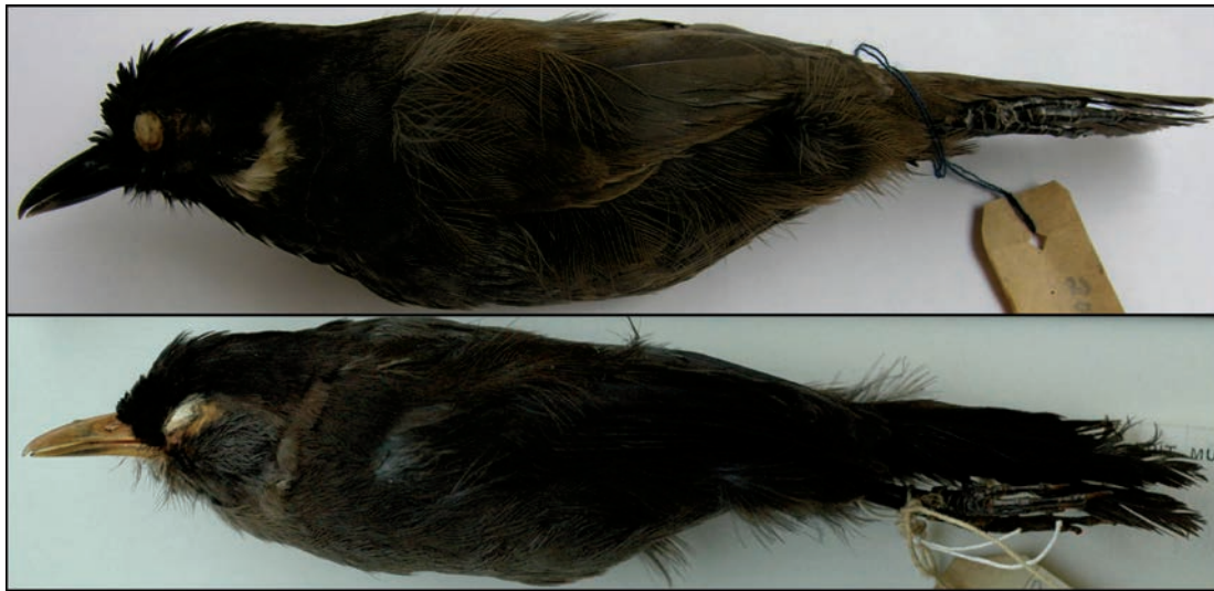
FIG. 2. Lateral comparison (upper: Stachyris nonggangensis ; lower: S. herberti ).

the base, the maxilla is also black with a paler tip, and the distal half of the mandible is increasingly pale toward the tip, approaching strong brown (7.5 YR 5/6). The forehead, crown, lores, and chin are dark grayish brown (7.5 YR 2/2 + ). The rachises of the forehead feathers are stiff. The fore parts of the auriculars and malar region are dark grayish-brown, behind which is white, forming a white crescent-shaped patch. The feathers of the throat and upper breast are white, and the rachises and distal parts of feathers are dark grayish brown, making dark-grayish-brown spots on the white throat and upper breast. The sides of the breast, lower breast, and belly are dark grayish brown, as are the flanks, hind neck,