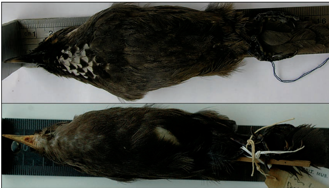
FIG. 3. Ventral comparison (upper: Stachyris nonggangensis ; lower: S. herberti ).

Measurements of holotype .—Unflattened wing 68 mm, tail 61 mm, bill (base at skull to tip) 19 mm, bill depth at nares 6.1 mm, tarsus 29 mm, two testes 2 × 1 mm, skull 100% ossified, body mass 33 g.